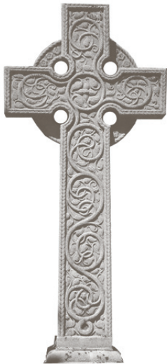
Celtic crosses are often found in Ireland and Great Britain. Some bear inscriptions in runes and the general style may be a combination of Christian and Celtic or pagan sun symbols.

Some researchers believe that the genes associated with the AMH moved with the early Celtic migrations. Although ancient ancestral Celts were a diverse group and varied in many ways, certain mythologies are consistent throughout most Celtic traditions, despite geographic or tribal boundaries. More than 300 Celtic deities have been described, many of which are reflected in classic Roman counterparts. The god Lugh (or Lugus) may have played an important role among those deities. Folklore and storytelling has infused Lugh's character with magic and fantasy, given him credit for thunder and lightening, and placed his stage in the sky.